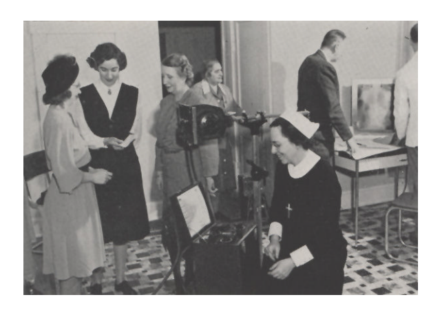
In the Diocese of Southern Ohio St. Andrew's Mission, Addyston

In Town and Country Deaconesses Serve in a Variety of Ways To Spread the Kingdom