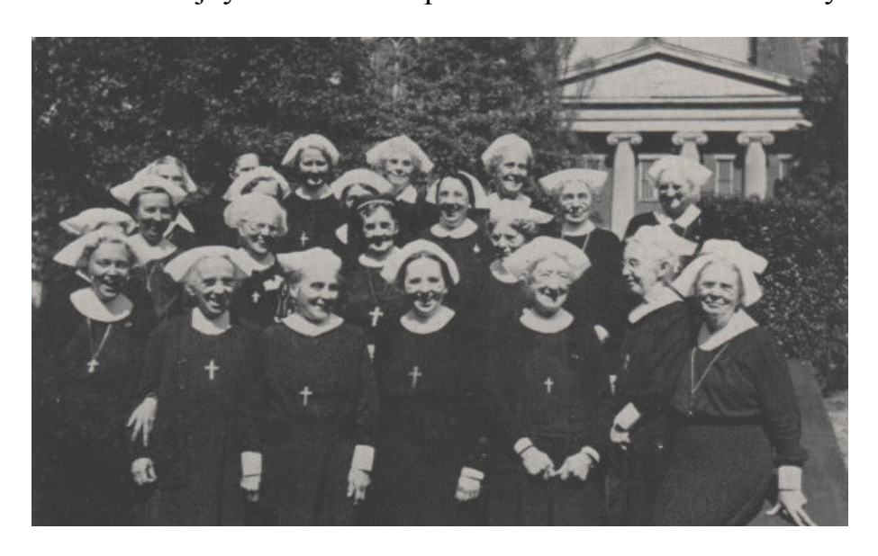
What is a Deaconess?

Deaconesses Gather in Retreat for Spiritual Refreshment And later Enjoy the Fellowship of Conference and Sociability.